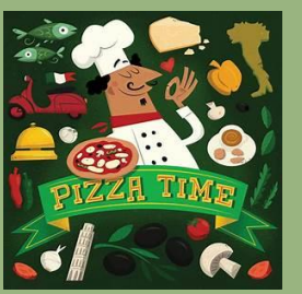
Buy one pizza and get one free card.

Please see below for the PTA email address and step by step directions on how to sign up to receive PTA emails.